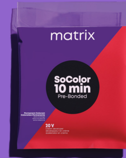
SoColor 10 min Pre-Bonded