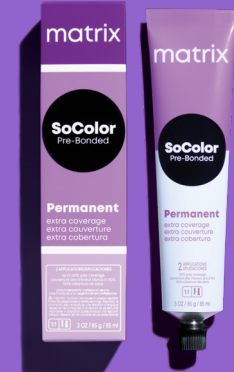
SoColor Pre-Bonded Extra Coverage